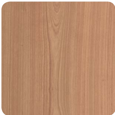
Elegant Cherry NEW

Australian Woodgrain Décors – Introducing three new timber styled laminate flooring décors, designed specifically for the Australian market – Breezy Brushbox, Heavenly Oak & Rich Jarrah.