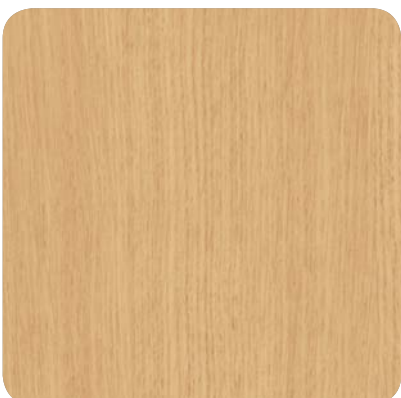
Heavenly Oak NEW

Australian Woodgrain Décors – The 10mm décors introduced have been specifically designed for the Australian market. The narrow plank design with small V-groove edges creates a more traditional feel to your floor that is unique to Formica Laminate Flooring.