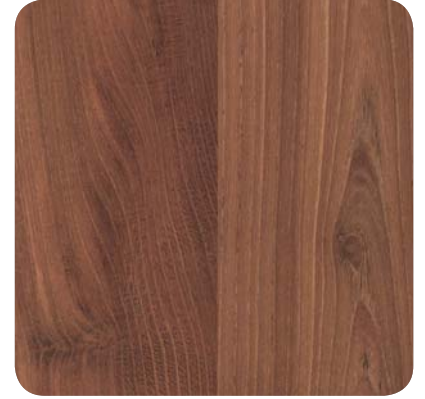
Rich Acacia NEW