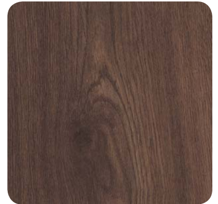
Mocha Oak NEW