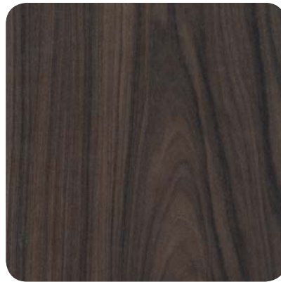
Charred Ebony NEW