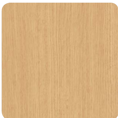
Heavenly Oak NEW