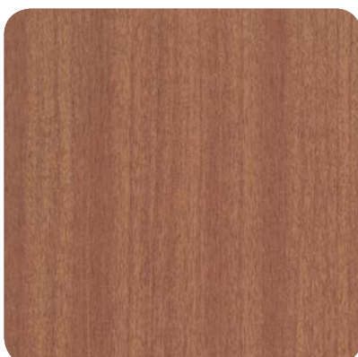
Breezy Brushbox NEW