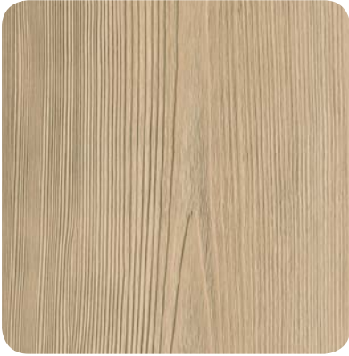
Ashen Cedar NEW

Suitable for large residential and general commercial floor areas with silent underlay. For heavy residential and general commercial traffic areas. Suitable for restaurants, hotel rooms, retail and public spaces. Each plank features a light groove on the edges to create the authentic planked effect of real timber flooring. All décors have an embossed finish