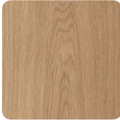
Malted Oak NEW