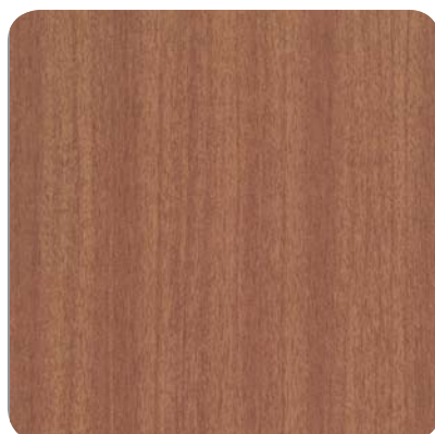
Breezy Brushbox NEW